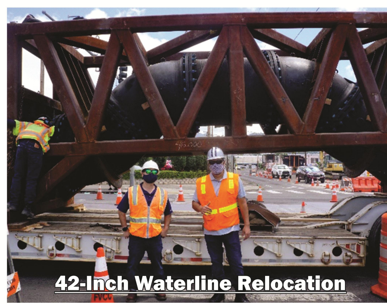
42-Inch Waterline Relocation