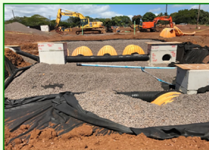
Underground detention basins after being buried

The Koa'e Makana Workforce Housing project was an affordable housing project based in Po'ipū, Kaua'i. With a growing need for affordable housing, the County of Kaua'i selected Mark Development to construct a community that addressed the needs of the workforce and their families. This 134, one-to-three-bedroom development was constructed on 11 acres of lush landscape next to the graceful Waikomo Stream. Spread out over 23, two-story buildings the property also includes ample tenant and guest parking, a playground for the keiki, and a community center to support family activities. The project site was determined suitable due to its central location with a close commute to job centers, schools, shopping, and established residential communities.