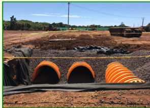
Underground detention basins to aid with storm water drainage