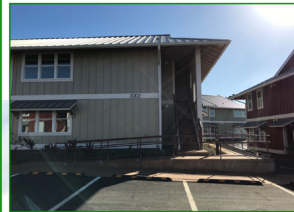
ADA accessible walkways

As of January 2021, the median price for a single-family home on the island of Kaua'i was $1.03 million where the average income is just over $60K. For low income families, affordable housing is a scarce necessity that needs to be more abundant. Thanks to Koa'e Makana, Kaua'i now has its largest affordable housing property and has begun to address its inequality in the housing market. With roughly 40" of rainfall a year, careful consideration of the drainage and layout led Bow Engineering to refine the flood plan to account for excess storm water runoff generated from a 100-year storm event. Solar panels were also installed on the units to aid in creating an even more affordable living situation that is environmentally friendly.