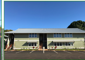
Completed two-story unit on the Koa'e Makana property